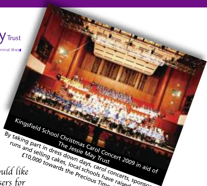
Kingsfield School Christmas Carol Concert 2009 in aid of The Jessie May Trust By taking part in dress down days, carol concerts, sponsored runs and selling cakes, local schools have raised nearly £10,000 towards the Precious Time Appeal.

Nursing care at home for children with a terminal illness