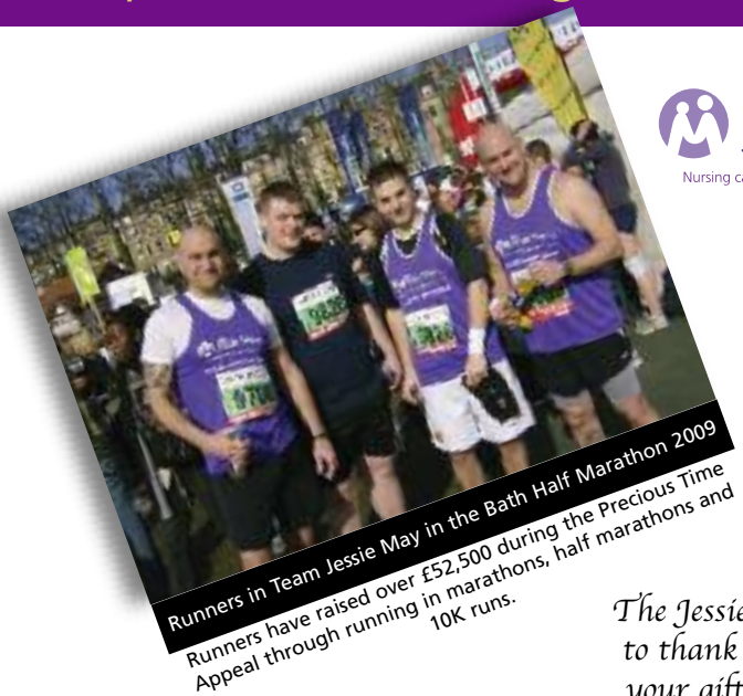
Runners in Team Jessie May in the Bath Half Marathon 2009 Runners have raised over £52,500 during the Precious Time Appeal through running in marathons, half marathons and 10K runs.

Help us to reach our target, call us now to make a difference! 0117 961 6840